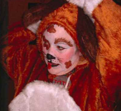
The Real Wizard of Oz - 2002

On behalf of everyone involved in this year's production, we would like to thank our amazing Chair and Director for all their hard work!