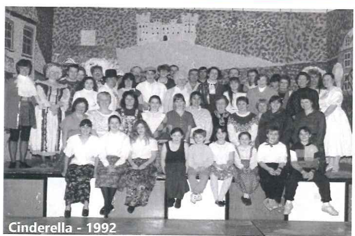
Cinderella - 1992