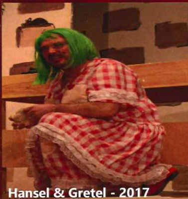
Hansel & Gretel - 2017

We are delighted to see so many of you here! Welcome to our 2018 pantomime, Jack and the Beanstalk. We hope you enjoy todays show, have a fun family filled evening and laugh your socks off... well not totally off as storm Georgina is still about!